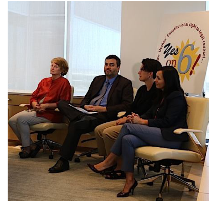
Above: Members of the ACLU of Utah staff participate in the press conference at the law firm of Holland & Hart announcing the filing of Remick v. Utah.

Thanks to strong advocacy organized by the ACLU of Utah, this brand new commission is free of active government prosecutors. We will continue to push the commission and legislature to create more meaningful - and immediate - improvements to this failing system!