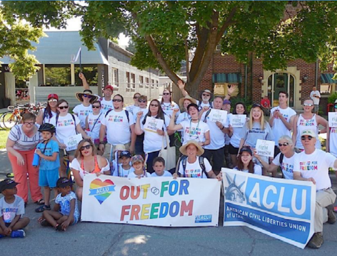
Above: ACLU of Utah staff, board, members, supporters and volunteers at the 2016 Utah Pride Parade in Salt Lake City.