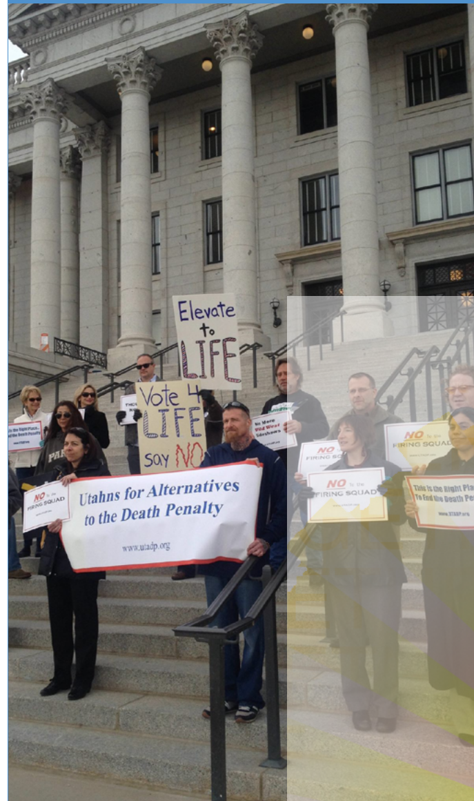
Above: Community members rally at the Utah State Capitol in opposition to the death penalty.