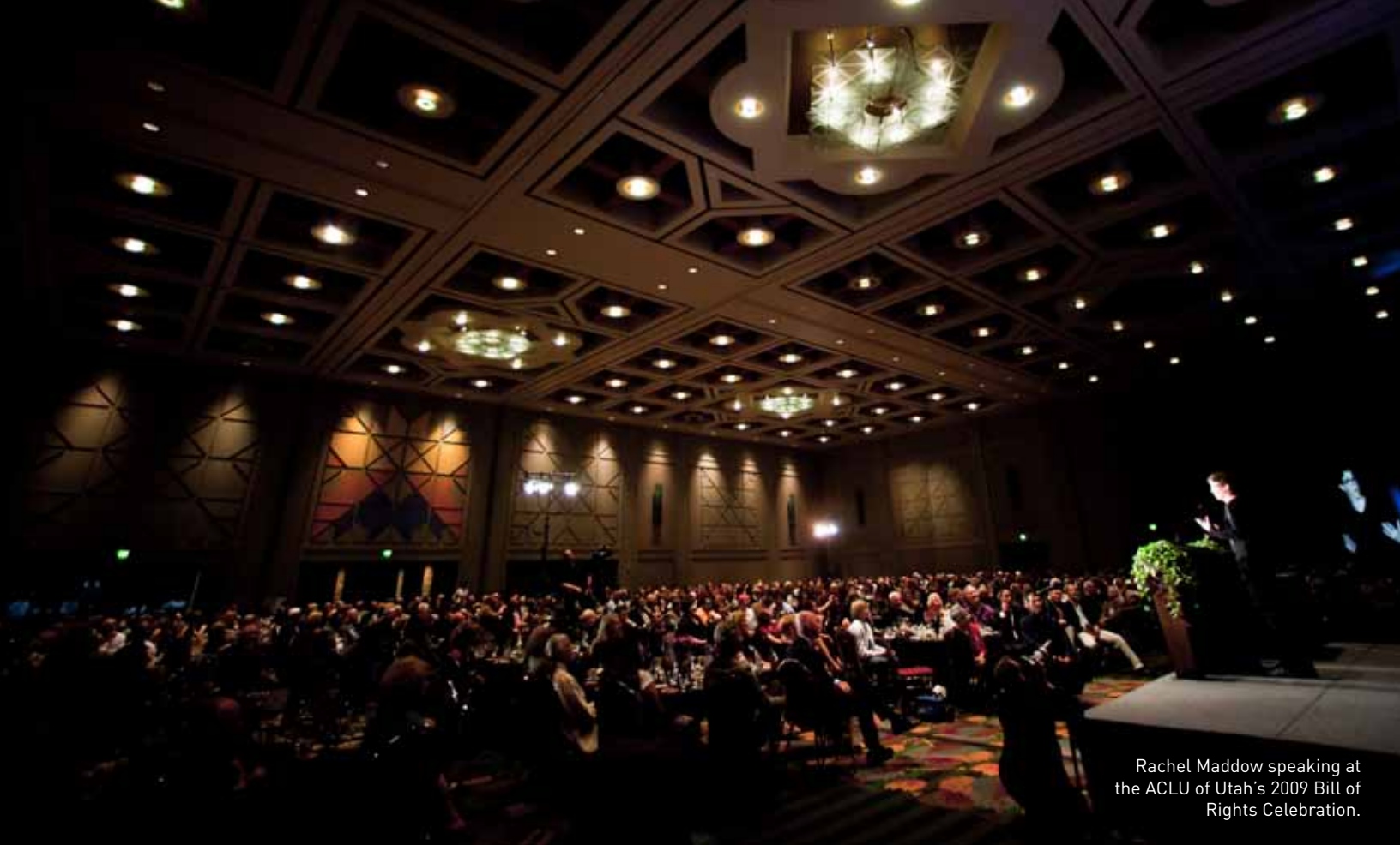
Rachel Maddow speaking at the ACLU of Utah's 2009 Bill of Rights Celebration.