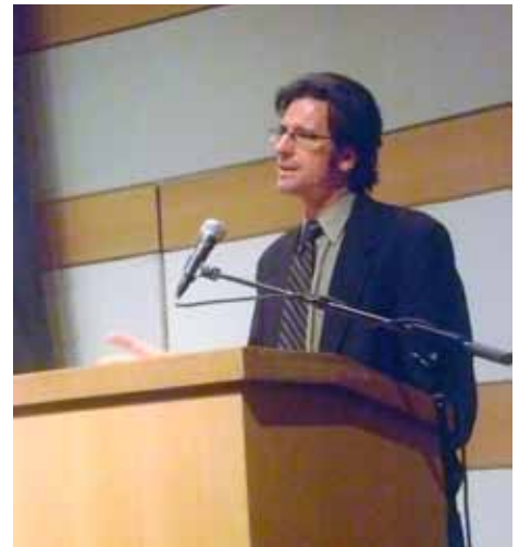
Graham Boyd, director of the ACLU's National Drug Policy Reform Project, discusses the film "American Violet," shown as part of a film series presented by the ACLU of Utah and the Salt Lake Film Center. The film shows some of the many problems faced by low-income people when they do not have access to adequate public defense.