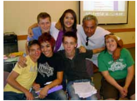
Students from high schools in Washington County - with supporters from the community - met with us during a trip to Southern Utah in 2009, and explained the difficulties they faced in trying to start Gay-Straight Alliances in their schools.

Utah's statutes create no boards or commissions to regulate the provision of indigent defense services; rather, funding and oversight of these services are left to individual counties (and several counties appear to exercise very little of the oversight responsibility passed along to them). Utah ranks 48th out of 50 states in per-capita spending on indigent