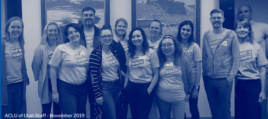
ACLU of Utah Staff - November 2019