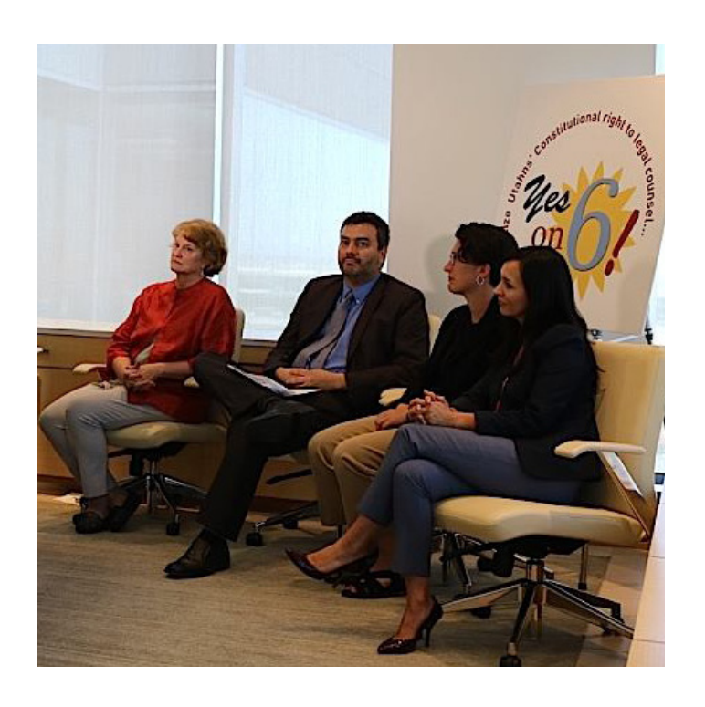
Above: Members of the ACLU of Utah staff participate in the press conference at the law firm of Holland & Hart announcing the filing of Remick v. Utah.

Thanks to strong advocacy organized by the ACLU of Utah, this brand new commission is free of active government prosecutors. We will continue to push the commission and legislature to create more meaningful - and immediate - improvements to this failing system!